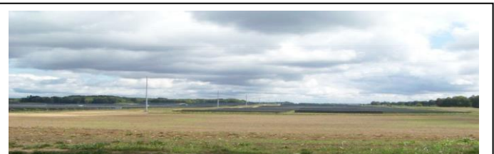
Not much double use going on here!