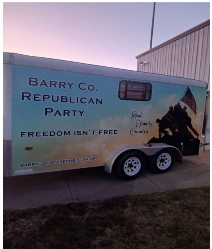
BARRY COUNTY REPUBLICAN PARTY'S NEW TRAILER!