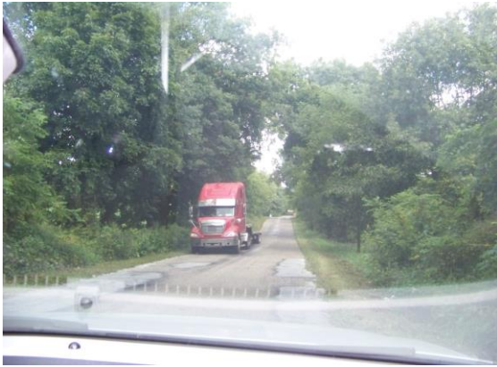
Impact on the Roads!