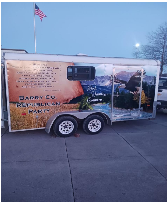
BARRY COUNTY REPUBLICAN PARTY'S NEW TRAILER!

Let her know if you want to participate!