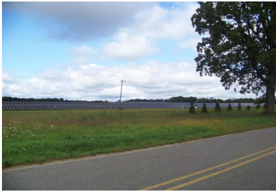
Minimal Set-back and no Screening!