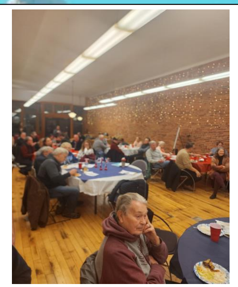
The Audience Looks on during the performance!