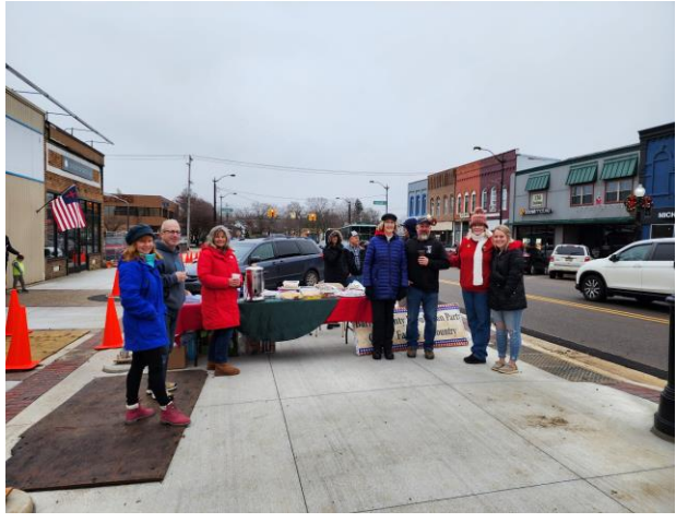
<u>Giving away cookies in downtown Hastings at</u> <u>Christmas time!</u>